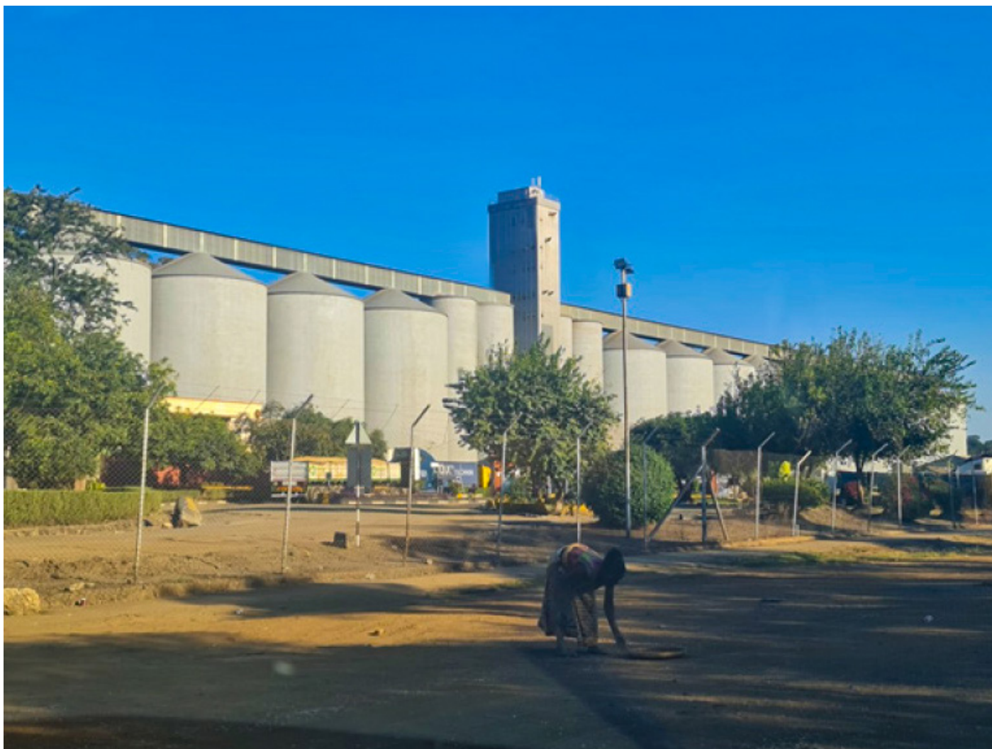
Struggle for survival...The ever-looming shadow of hunger is stalking many Zimbabweans, including Miriam Billiart (above). The government may claim that Zimbabwe has attained national food security, but the hunger at household level is dire.

She is not the only one reeling under economic hardships. Near the depot entrance is a scrum of a dozen men who fiercely jostle whenever a haulage truck approaches the locality. They are paid a measly US$2 each to load a massive truck. It is back-breaking work, but they reckon this is better than starving at home.