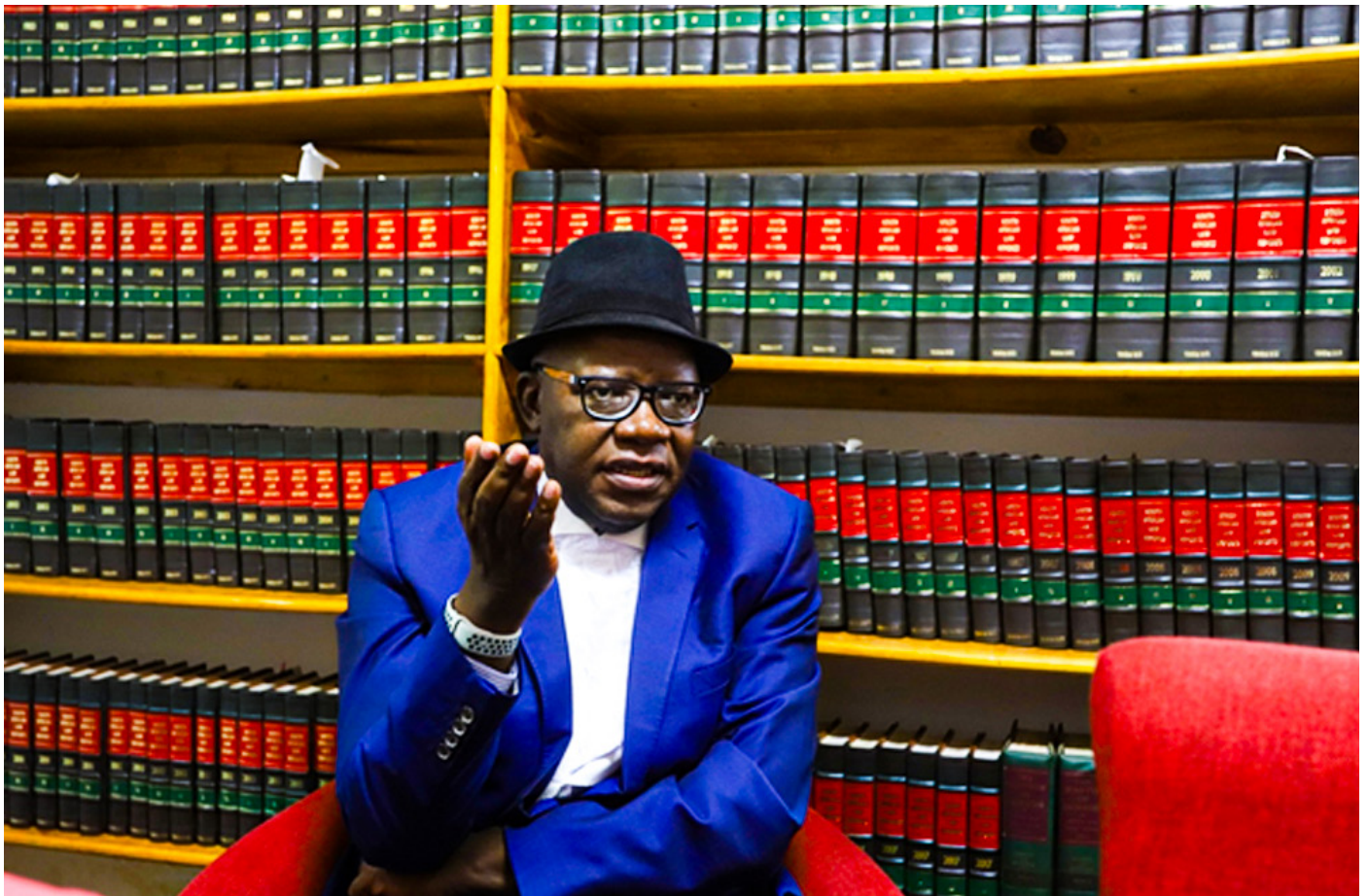
Former Finance minister and ex-chairperson of Parliament's Public Accounts Committee, Tendai Biti, says Command Agriculture was a looting scheme.